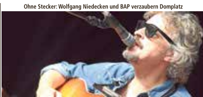
Ohne Stecker: Wolfgang Niedeeck und BAP verzaubern Domplatz

Ohne Stecker: Wolfgang Niedeeck und BAP verzaubern Domplatz. Die Musiker haben sich für ein Konzert am Domplatz entschieden, um die Zuschauer zu begeistern.